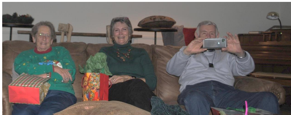
Can you guess who our photographers were? (Lyn & Roy)