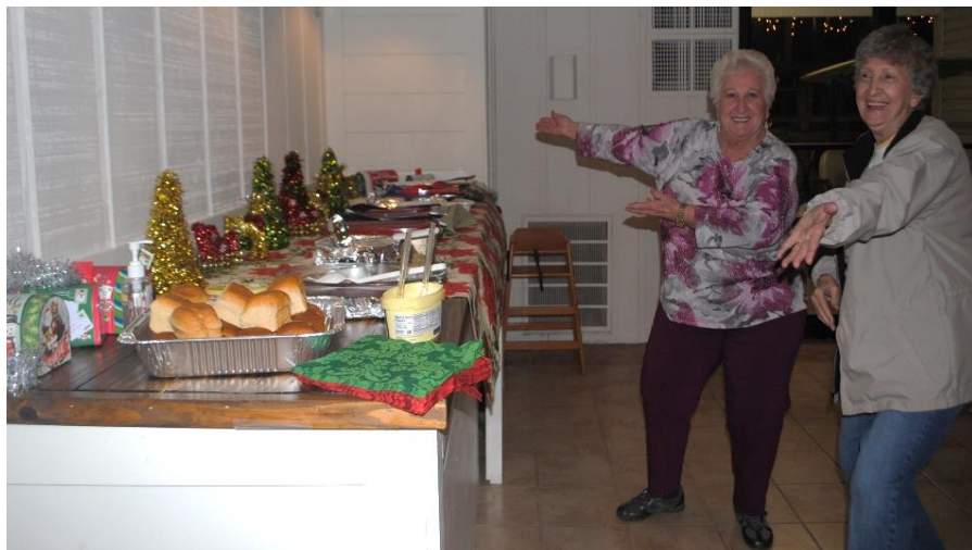
TaDa! Dinner is ready!