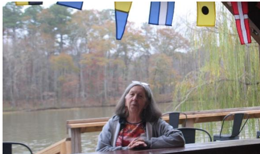
I'll have a ham on rye.