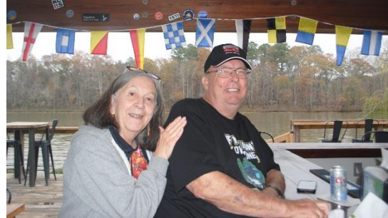
Nice to bump into someone you know!

Everyone gathered at 5:30 p.m. for dinner. The host provided ham, turkey, dressing, gravy & rolls and dessert. All others either provided a side dish or a dessert to share. It was a very satisfying holiday meal.