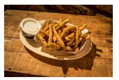
Our table from the south end...