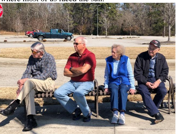
3 amigos and 1 chica