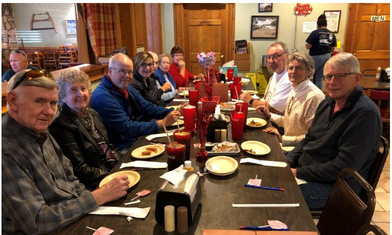
Our table from the north end...