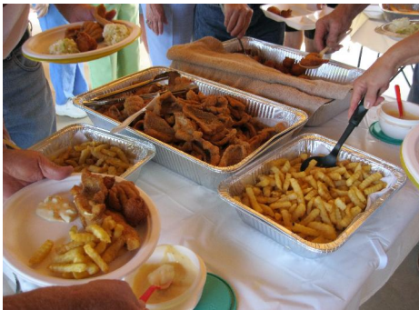
Thursday night fish fry