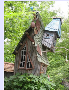
Lopsided Tree House