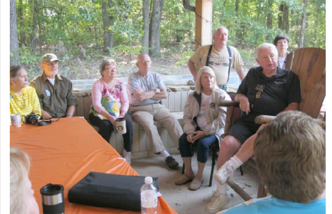
Metro Atlanta Winnies engrossed in their business meeting on the deck of the club house.