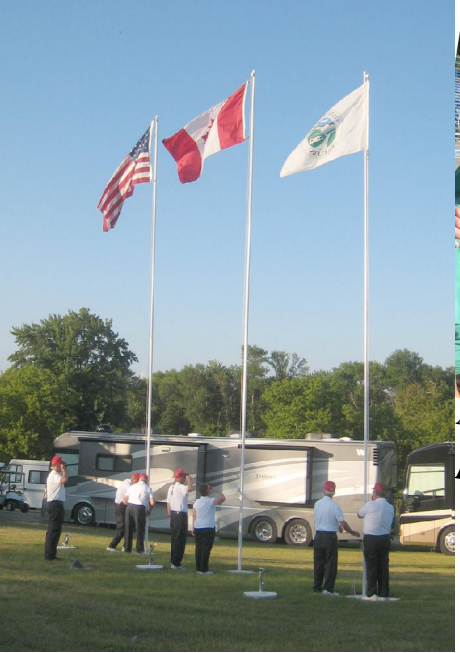
Presenting the Flags at Opening Ceremonies