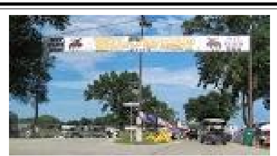
WIT GRAND NATIONAL 2013