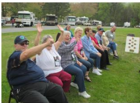
When asked who was going to win this ball game, the visiting states' team let me know loudly that they intended to win.