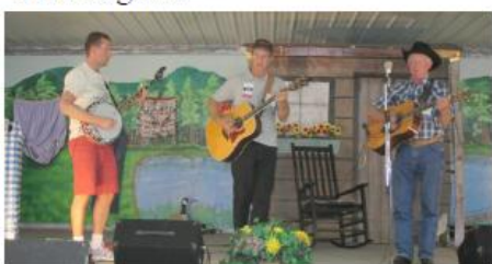
A good Saturday morning breakfast of pancakes, sausages and coffee started us off.