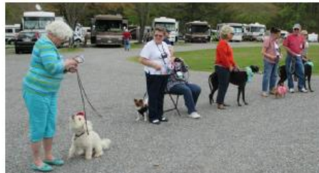
Only a few of our contestants