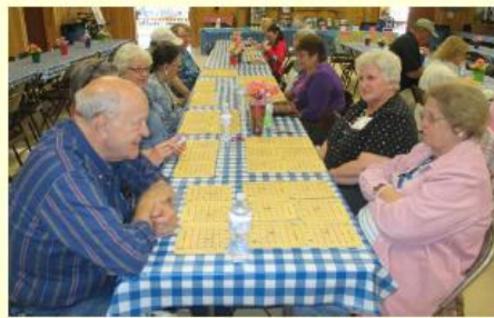
Everyone enjoys BINGO