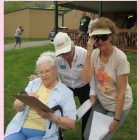
The Judges compare notes