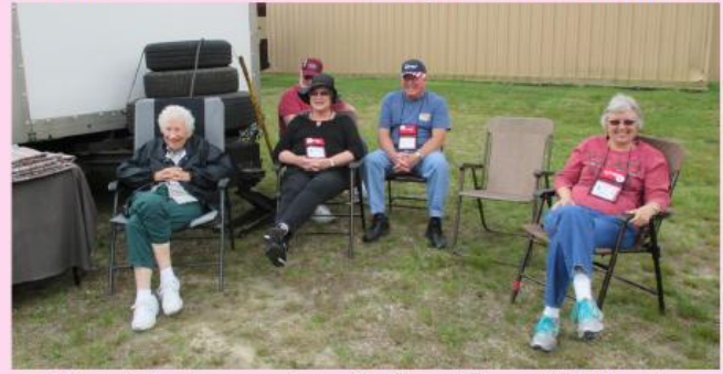
People in the grandstand a.k.a. "Peanut Gallery"