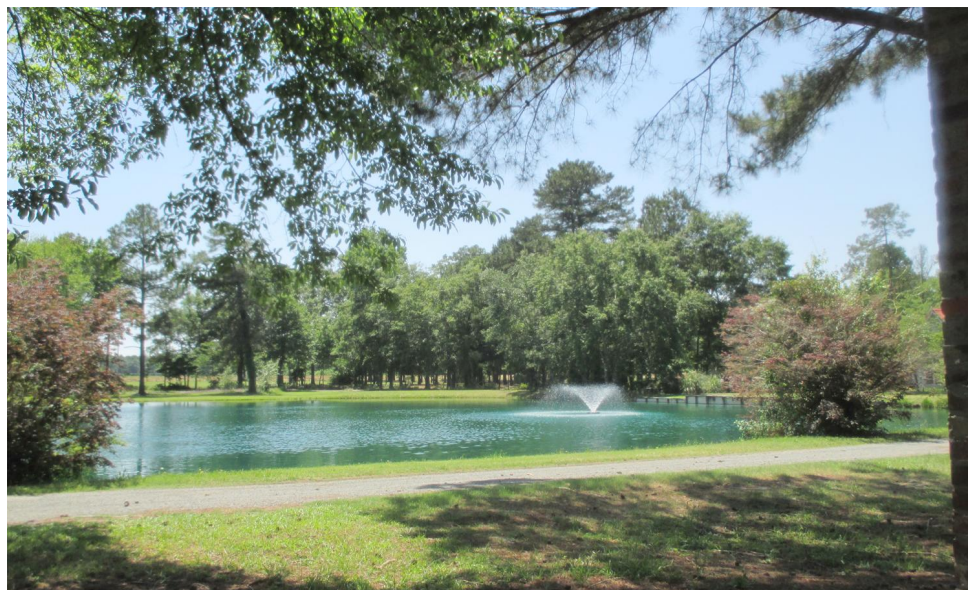
The view from the front porch of the club house at Brickyard Plantation RV Resort

It seemed our RVs had been placed in the middle of a golf course - in fact, that is just what happened at the Brickyard Plantation RV Resort in Americus, Georgia. At our May 16-18, 2014 State outing there, we had sixteen coaches with 34 participants, and it was a wonderful, friendly outing.