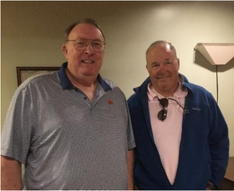
Our new leaders