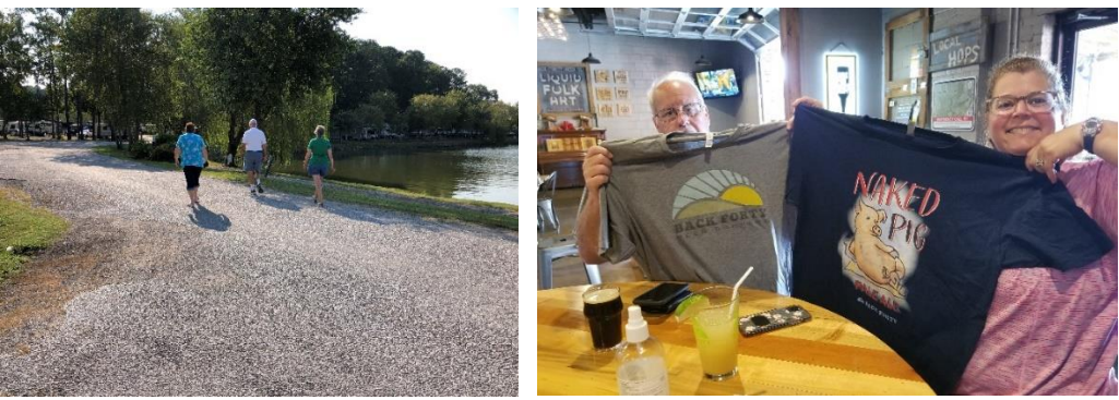
A nice stroll around RRL after breakfast