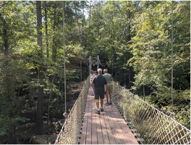
"the" suspension bridge over the Black Creek