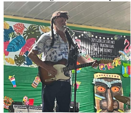
I'm so glad that you are mine III