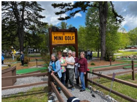
1st group finished!