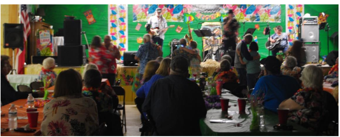
The Band Silver is excellent and we're so happy to have had them come play at our Grand Finale event.