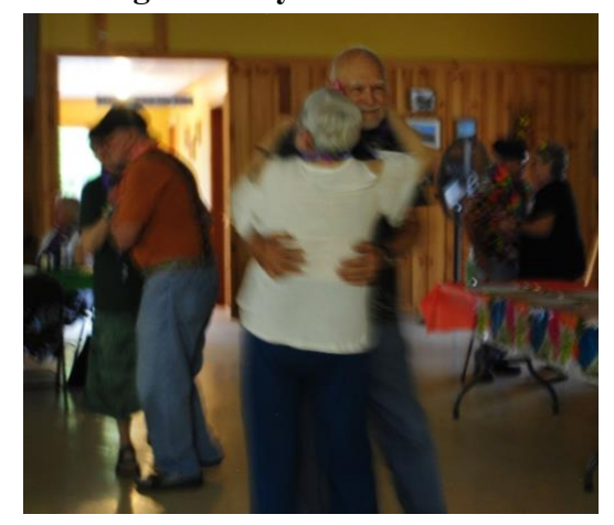
IIII You are always on my mind III