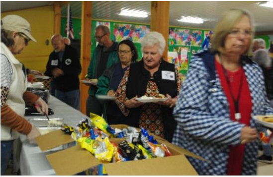
Next, we enjoyed an Ice Cream Social.