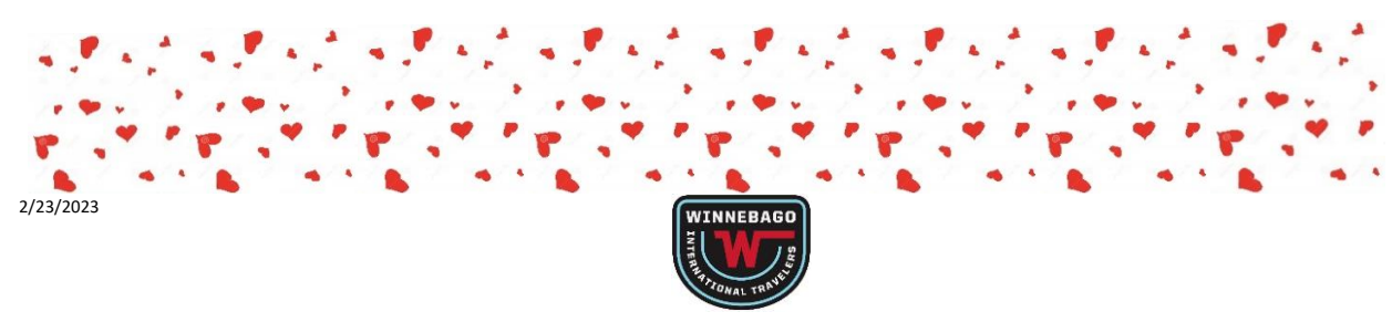
2023 GWR Schedule