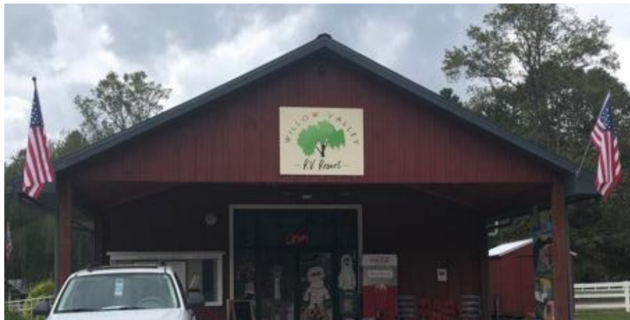
Willow Valley RV Resort Rabun Gap, GA