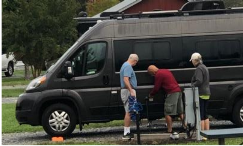
Always something to show or fix....