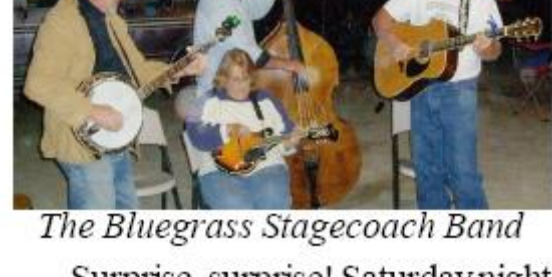
The Bluegrass Stagecoach Band