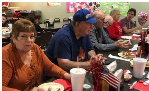
Table talk took place while we waited for our lunch orders and enabled us to catch each other up with our tales. We sat around talking and talking and enjoying our fried appetizers.