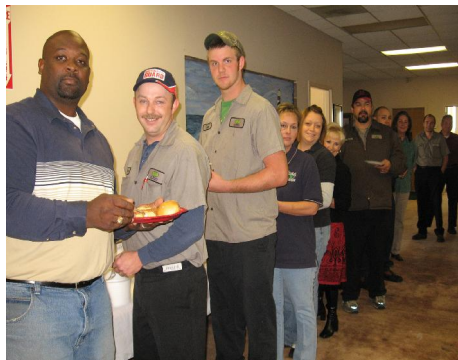
Happy Bleakley employees line up for their annual Gone with the Winnies appreciation lunch.