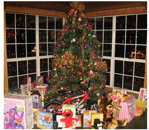
The "Toys for Tots" Christmas Tree