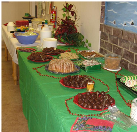
Serving tables all decorated for the season