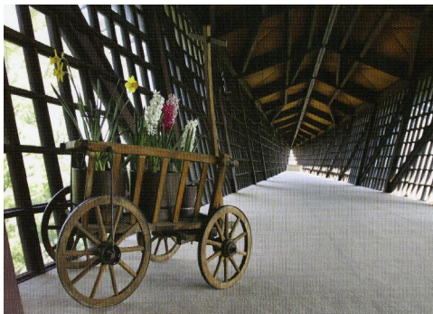
218-foot Cantilevered Room over Forest Floor

A full orchestra of instrument-equipped mannequins played their instruments on cue every time, as did many, many other musical devices used to entertain before the time of television.