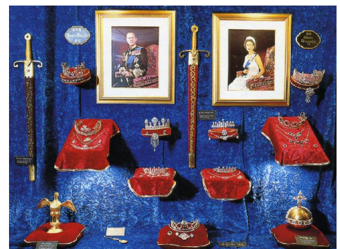
The Crown Jewel Collection

And most important of all: (10) everyone praises the man and thanks him for his cooking efforts; (11) the man asks the woman how she enjoyed "her night off." And, upon seeing her annoyed reaction, concludes that there's just no pleasing some women.