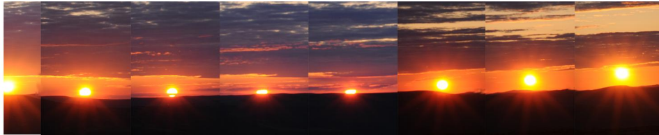
12:45a.m. 1:00a.m. 1:15a.m. 1:30a.m. 1:45a.m. 2:00a.m. 2:15a.m. 2:30a.m.

HIGHLIGHT #1: We drove up the Alaska Highway to Fairbanks to be in the area on June 21st - the date of the Summer Solstice. We drove the Jeep Wrangler 150 miles northeast of Fairbanks near the Arctic Circle to a place called Eagle Summit - the best place to view the Solstice. Jesse took a picture every 15 minutes through the entire thing. It was amazing to see how the sun just dipped down and rolled across the mountain tops and began to rise again.