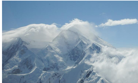
Denali (Mt. McKinley) from the air

HIGHLIGHT!!! We flew over and around and in between mountain peaks, including a spectacular Mt. McKinley with a minimum of clouds, and hundreds of miles of snow-capped mountain ranges and glaciers. It was breathtaking! This flight alone was worth the trip.