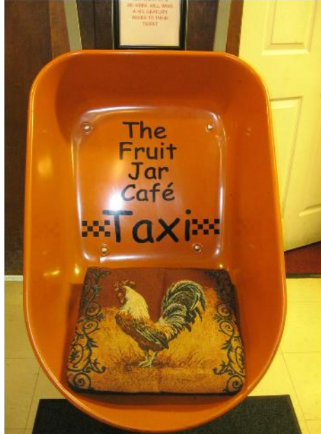
The wheelbarrow at the Fruit Jar Cafe for hauling out people who have overeaten