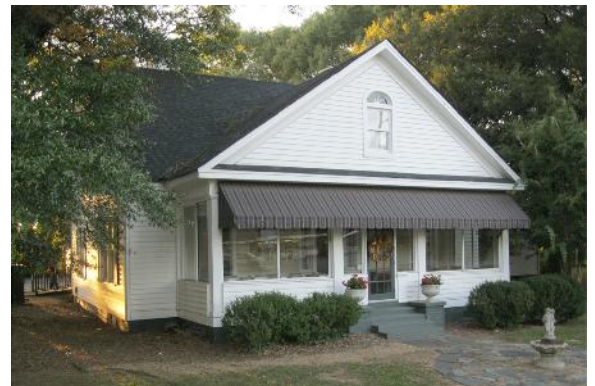
Adairsville Inn Restaurant In Historic Downtown Adairsville