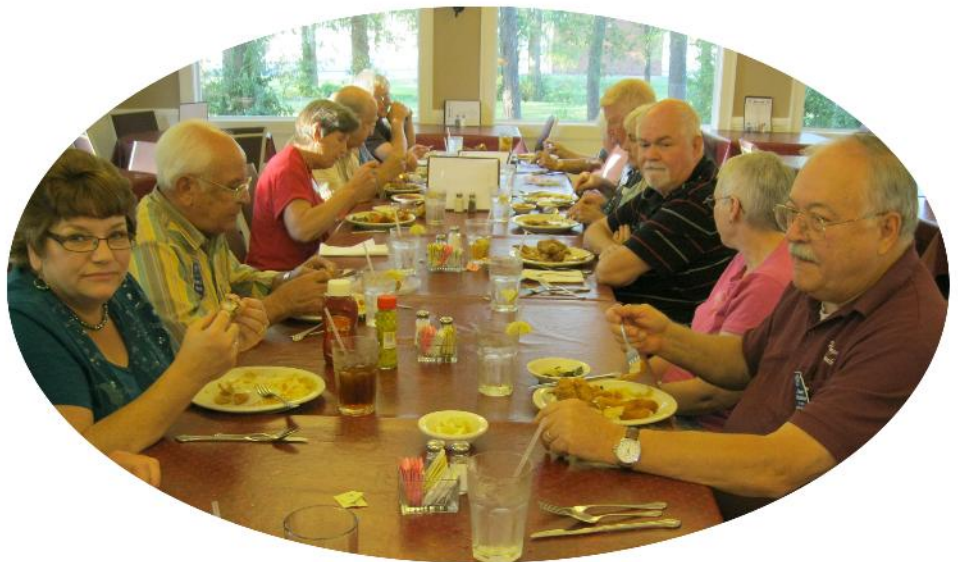
Dinner at the Adairsville Inn Restaurant