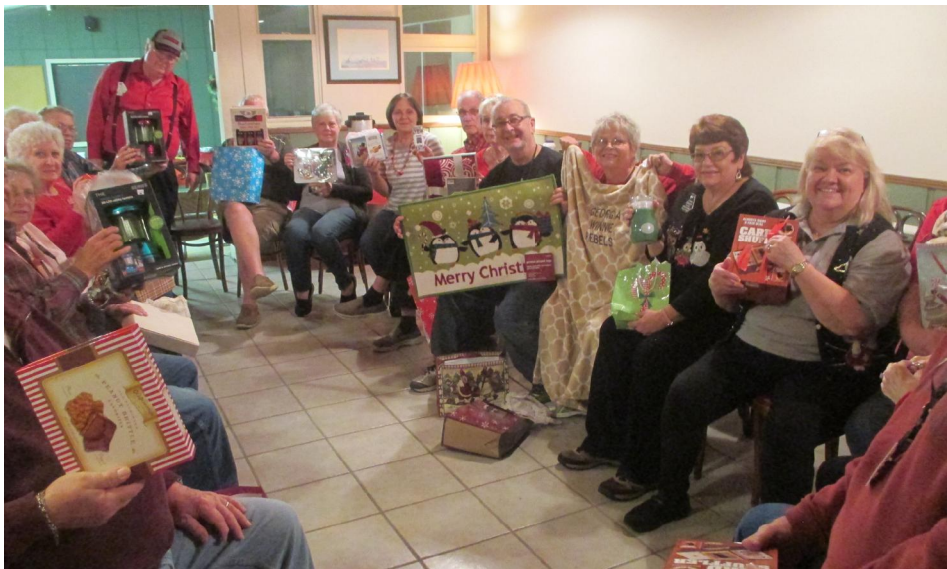
Part of the group displaying the gifts they finally wound up with.